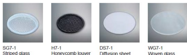
SG7-1 Striped glass